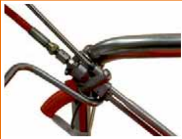
Stainless steel top-frame with gun rest / lance holder.