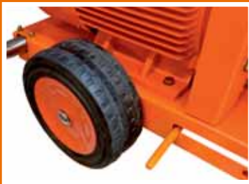
Galvanized frame with built in brake and solid wheels.