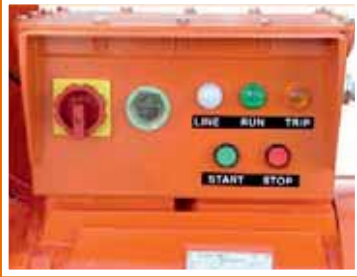
Die cast electrical box with main switch, overload relay & hour meter.